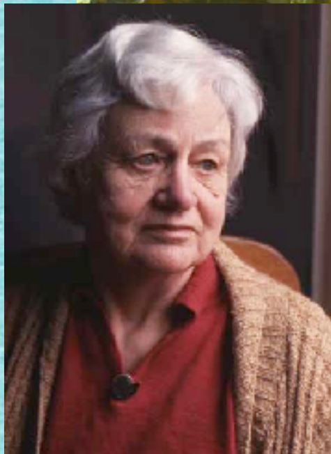
▶ Judith Wright “A Wattle Tree”