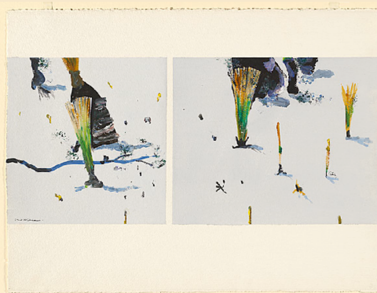
FRED WILLIAMS Regenerating Grass Trees After Fire, 1980

World broods with warm breast and with ah! bright wings.