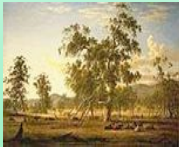
Artist John Glover, Tasmania