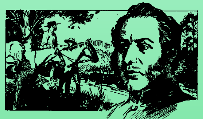
THOMAS LIVINGSTONE MITCHELL